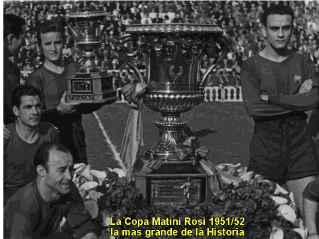
La Copa Matini Rosi 1951/52 la mas grande de la Historia

Il F.C. Barcelona vince la Copa Eva Duarte de Perón , messa in palio tra la vincente del Campionato e della Coppa di Spagna, senza disputare alcuna partita essendo risultato vincitore di entrambe le manifestazioni.