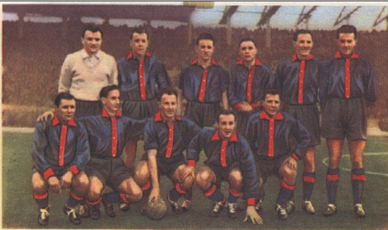
2. — FC LIEGEOIS — FC LUIK