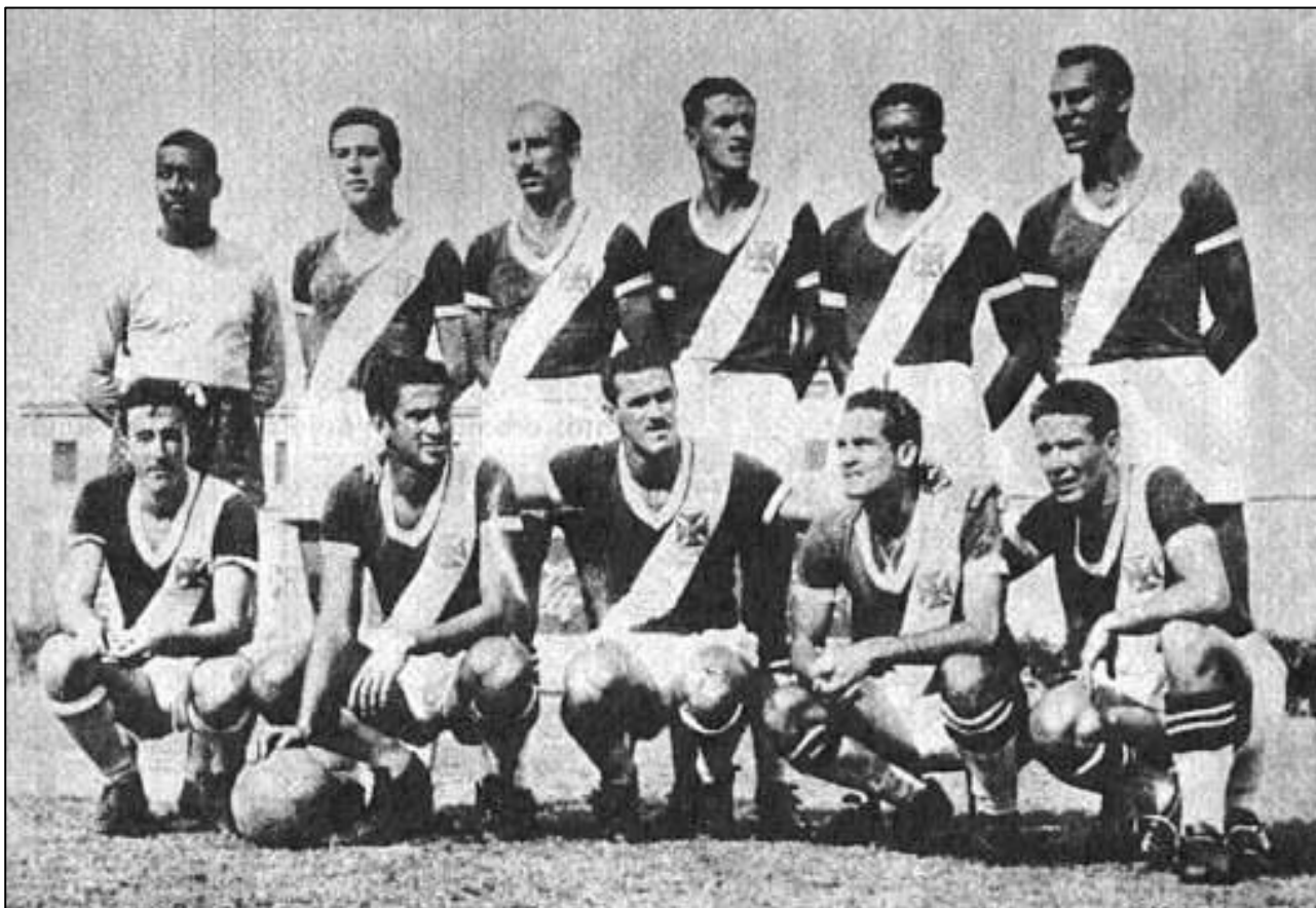
Vasco, 1952. Em pé: Barbosa, Haroldo, Augusto, Danilo, Jorge e Eli. Agachados: Edmur, Ipojucan, Ademir, Maneca e Chico.