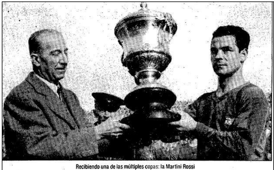
Recibiendo una de las múltiples copas: la Martini Rossi