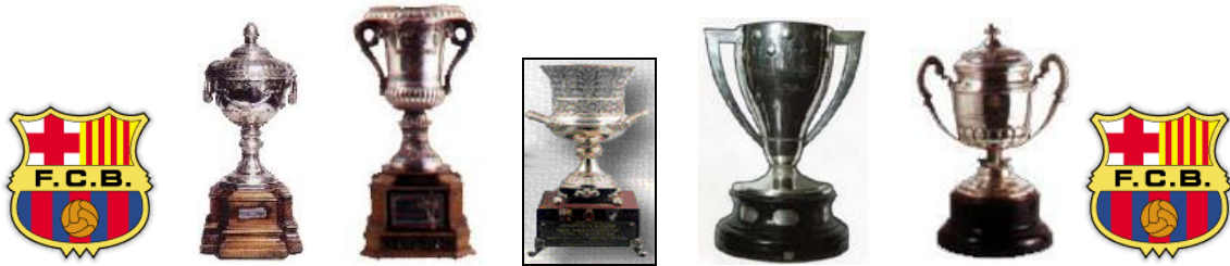
Nell'ordine: Coppa Latina, Coppa Eva Duarte, Coppa Martini e Rossi, Coppa campionato, Coppa del Generalissimo (Coppa Spagna)

Il F.C. Barcelona vince la Copa Eva Duarte de Perón , messa in palio tra la vincente del Campionato e della Coppa di Spagna, senza disputare alcuna partita essendo risultato vincitore di entrambe le manifestazioni.