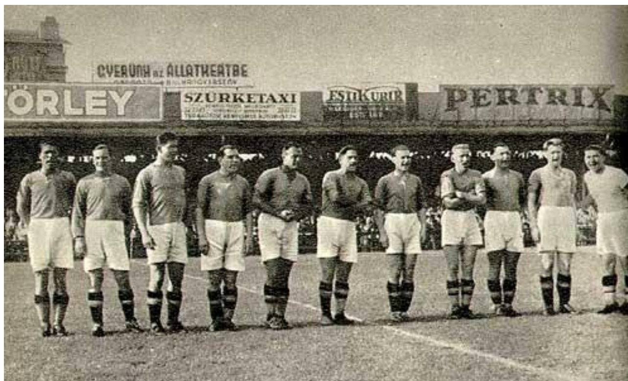
HUNGÁRIA FC (MTK) 1935-'36