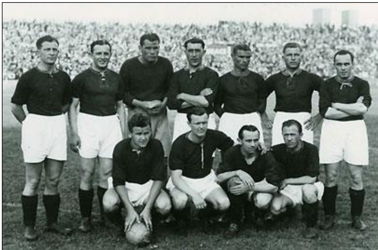
Horní řada zleva: Josef Košťálek, Josef Čtyroký, Bohumil Klenovec, Josef Sedláček II., Gejza Kaloczay, Jaroslav Burgr, Ferdinand Faczinek. Dolní řada zleva: Jaroslav Bouček, Erich Srbek, Oldřich Nejedlý, Oldřich Zajíček