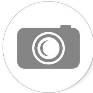
IMAGE NOT AVAILABLE