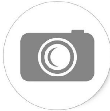
IMAGE NOT AVAILABLE