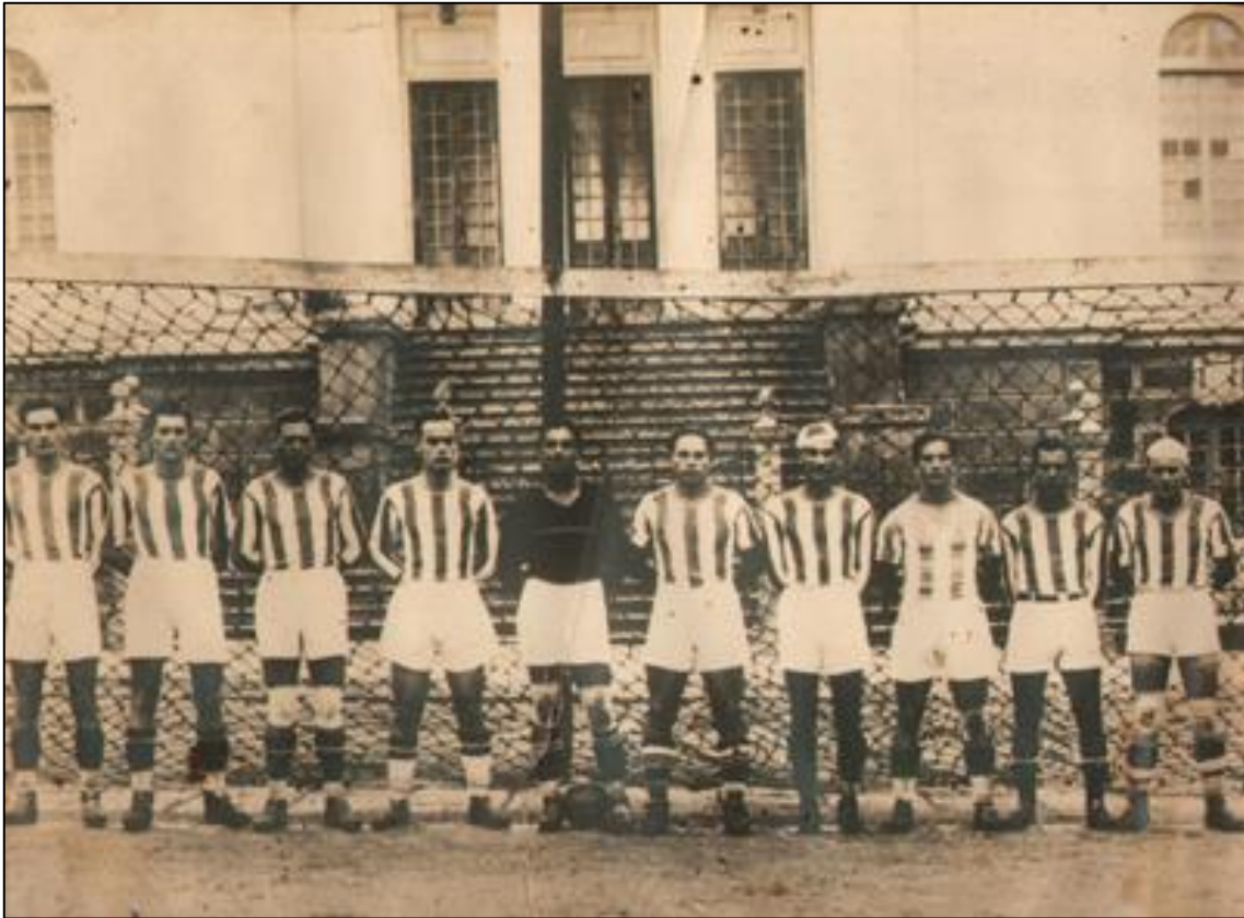
Los héroes del Cartaginés en 1936 posan en Plaza Iglesias de Cartago, los brumosos son los únicos en la historia que el año de su ascenso a primeras consiguieron el cetro de campeones.