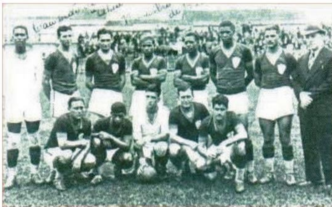
Associação Portuguesa de Desportos 1936